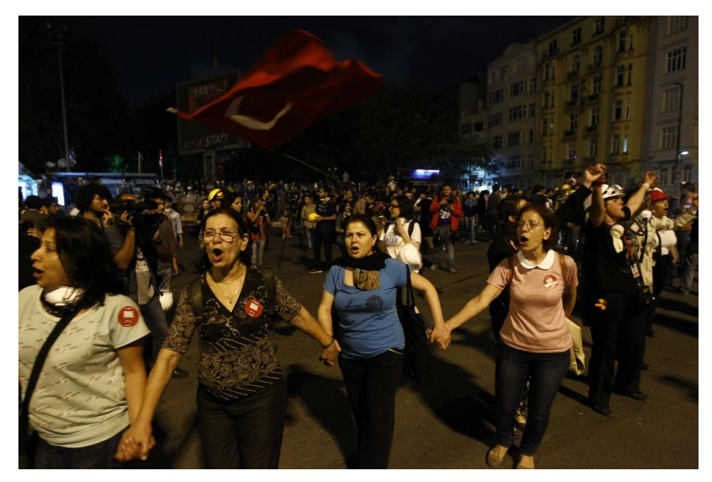
Appendix D: Woman with veil protesting together with feminists2.

\underline{ \text{Appendix } C} \text{: The body chain of mothers to protect their children from the police}^{\text{!}}.